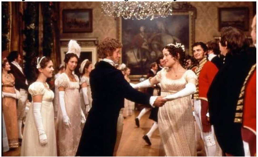
The evening of January the 26^{th} , 2024, 7:00 pm until 10:00 pm At the Poinsettia Pavilion at 3451 Foothill Road in Ventura

ACHEV cordially invites you to Of Winters Past... An English Country Dance Formal.